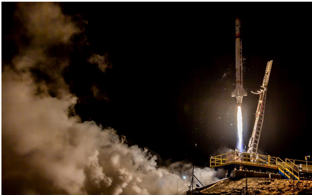
Figure 1 MIURA 1 taking-off in its maiden flight (7th October 2023)