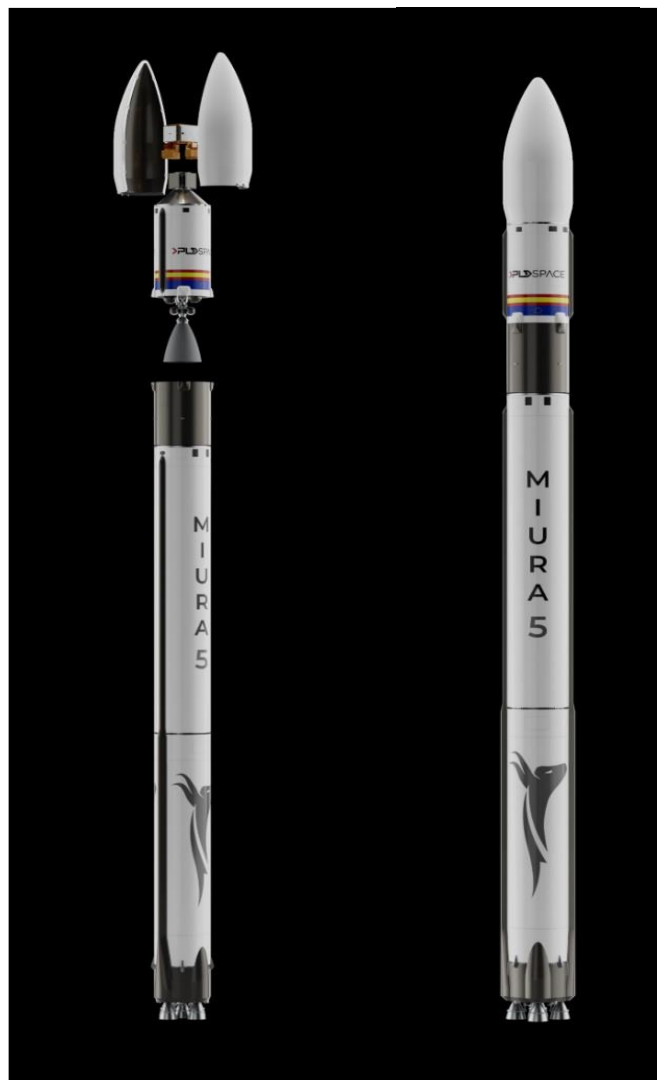
Figure 2 MIURA 5 configuration

In addition, PLD Space uses bio-kerosene (bio RP-1) and liquid oxygen (LOX) in its in-house designed TEPREL-C engines, thereby contributing to a reduction in carbon emissions.